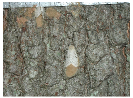
Adult female spongy moth with egg mass

A native of Europe, the spongy moth ( Lymantria dispar ) was accidentally released in Massachusetts in 1869. Infestations of the pest have gradually spread, leaving behind millions of acres of defoliated trees. Since 1980, the spongy moth has defoliated more than one million acres in Maryland. During this period, the Spongy Moth Cooperative Suppression Program sprayed the trees with carefully selected insecticides on another 1.8 million acres statewide. The suppression spray program has protected the trees from severe leaf loss on an average of over 97 percent of the acreage treated each year.