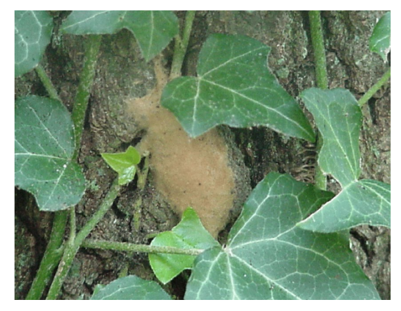
Spongy moth egg mass

Spongy moth caterpillars do all the harm. They hatch in large numbers - an egg mass can contain more than 1000 eggs - and the caterpillars feed ravenously on leaves.