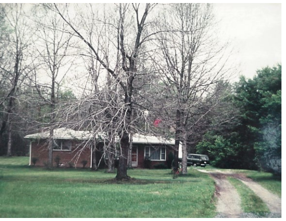
Suburban yard in late June - trees were defoliated by spongy moth caterpillars.

Responding to the defoliation in 2007 and to population predictions from the 2007 fall egg mass survey program, MDA's Spongy Moth Suppression Program sprayed 99,222 acres in the spring of 2008. Statewide that year, the caterpillars defoliated the trees on 19,279 acres. In the ensuing years the population has continued to cycle up and down. The year 2009 brought a need to treat 32,543 acres, while in 2010 only 144 acres were treated, and no areas needed treatment in 2011. Acres treated rebounded to 2,303 in 2012, increased to 11,996 acres in 2013, and 5,164 acres in 2014. Spongy moth populations go through cycles, but are heavily influenced by seasonal weather conditions, and can fluctuate from a low to a high potentially damaging level in as little as two years.