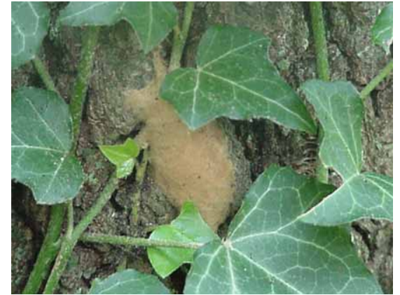
Gypsy moth egg mass

large numbers - an egg mass can contain more than 1000 eggs - and the caterpillars feed ravenously on leaves.