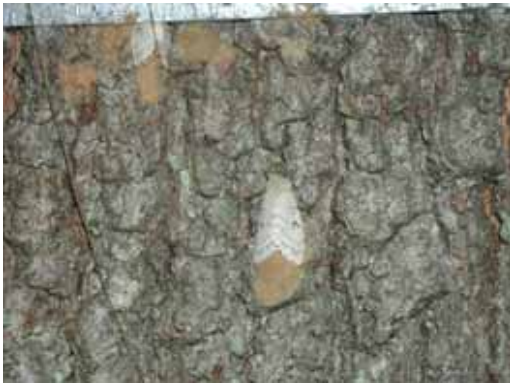
Adult female gypsy moth with egg mass

In 2002, MDA sprayed 39,134 acres of trees statewide and only 112 acres of trees (untreated) were defoliated. As populations again began to collapse, spray acreage was reduced to 14,053 acres in 2003 and to 660 acres in 2004. There was no suppression spraying in 2005.