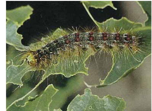
Late instar gypsy moth caterpillar.

Maryland Department of Agriculture Forest Pest Management Section 50 Harry S. Truman Parkway Annapolis, Maryland 21401 www.mda.state.md.us