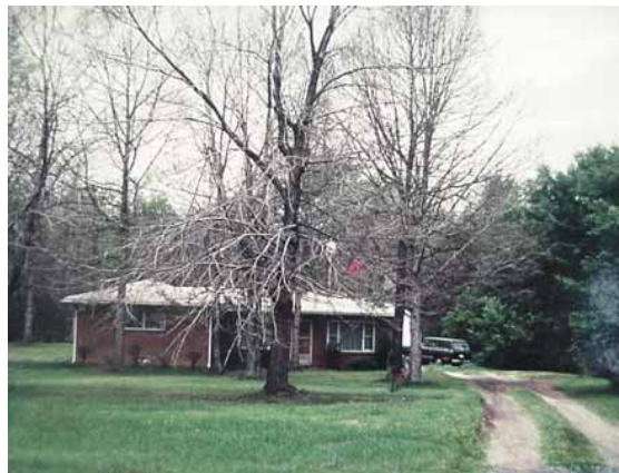
Suburban yard in late June - trees were defoliated by gypsy moth caterpillars.

Gypsy moth caterpillars do all the harm. They hatch in