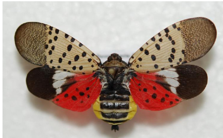
Fig. 1 - Adult Spotted Lanternfly

Adult SLF are large (approx. one inch long), strikingly colored insects, with grayish spotted front wings and red, white, and black patterned hind wings. The body is yellow and black banded (Fig. 1 – Adult SLF). However, the insect dramatically changes appearance throughout its life cycle. The tan eggs, 30-50 per egg mass, covered with a grey waxy coating, are laid on any vertical surface from late September until frost (Fig. 2 – Eggs; Fig. 3 –Eggs on barrel). Eggs hatch from late April to early May, into tiny white-spotted angular black nymphs (Fig. 4 – Young nymphs) and begin feeding by sucking the juice from host plants. As they grow older, nymphs molt and become bright red and black with white spots (Fig. 5 – Full-grown nymphs). Adults first appear around mid-July to feed, mate, and lay eggs (Fig. 6 – Cluster of adults).