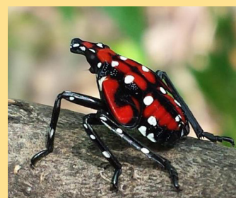
Fig. 5 - Full-Grown Nymph