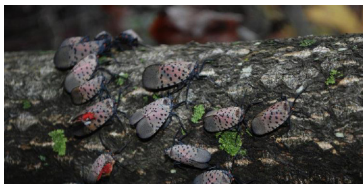
Fig. 6 - Cluster of Adults