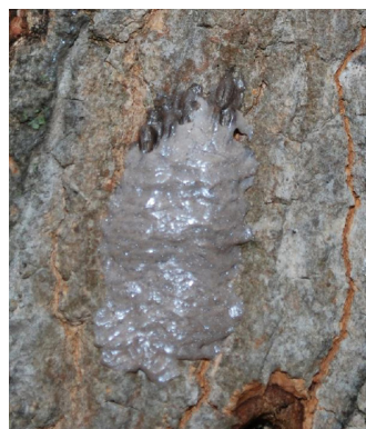
Fig. 2 - Egg Mass