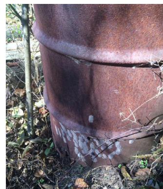
Fig. 3 - Egg Mass on barrel