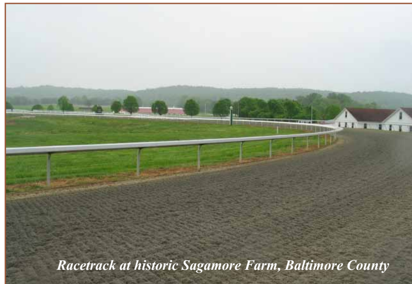
Racetrack at historic Sagamore Farm, Baltimore County