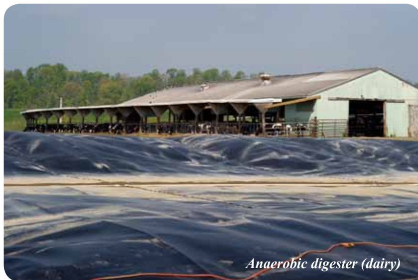
Anaerobic digester (dairy)

Foundation approval is subject to significant limitations. The size of a facility is limited to 5 percent of the easement area or five acres, whichever is less. The location of a facility is to be in an area that will minimize the impact to the agricultural uses of the land. Also, some locations may either not be permitted or may require height restrictions for wind turbines because they will cause interference with Doppler Radar at the Patuxent River Naval Air Station. Foundation easements which have federal or county funding may be precluded from approval. Applications for consideration are to be submitted no later than June 30, 2018 as this law prohibits Board approval after June 30, 2019.